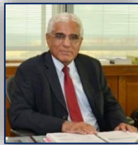
Dr. Indrajit Coomaraswamy Governor Central Bank of Sri Lanka

Capital Market - Panel Discussion 11.20 a.m. - 11.50 a.m.