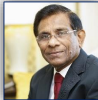
H.E. Nimal Weeraratne SL High Commissioner Singapore