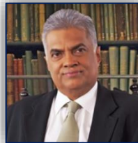
Hon. Ranil Wickremesinghe Prime Minister Sri Lanka

Key Note and Q&A 09.15 a.m. - 10.00 a.m.