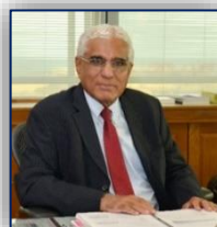
Dr. Indrajit Coomaraswamy Governor Central Bank of Sri Lanka

Economic Outlook 10.30 a.m. - 10.50 a.m.